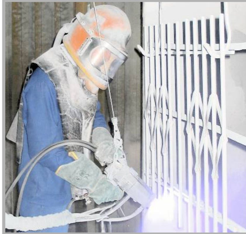
Zinc Spray Booth