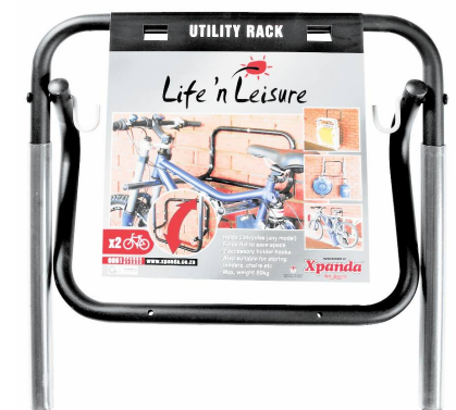
The Xpanda utility rack