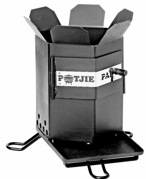
The Xpanda potjie pal